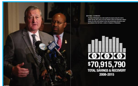
Our report ends with a photo of both Mayor Kenney and Mayor Nutter, a caption that reads “Moving Forward,” and an infographic that conveys our total savings and recovery over the past eight years. This spread demonstrates our success under the outgoing mayor and makes a strong case for continued support.

To keep our pages readable, we used colored headings and short paragraphs, with sufficient white space in between.