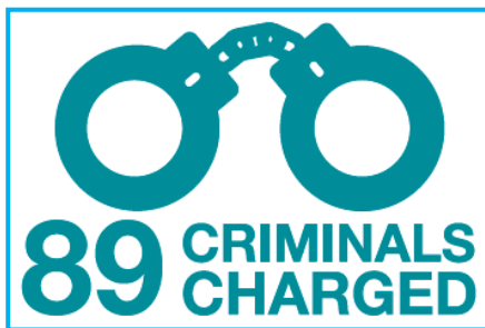
We highlighted impressive statistics with salient infographics, dispersed throughout the report.