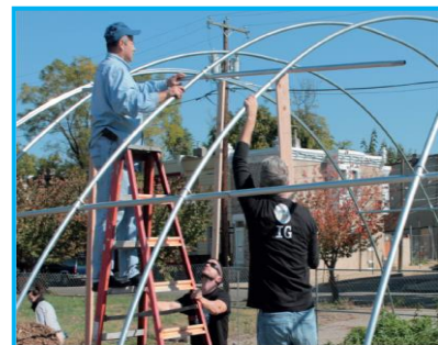
In 2011, we discovered more than $100K in unused Verizon bonus points in an unauthorized corporate rewards account. The unused points were turned into gift cards to help PhillyRising purchase supplies to help revitalize the community. This picture illustrates the OIG's ability to enact positive change on a grassroots level.

Choose statistics that accurately capture the year's work and resonate with readers. To the extent that an agency can report financial accomplishments, like savings and recovery, these can be a great tool to demonstrate utility. But don't focus on financial results alone. Consider other performance indicators that are unique to your organization. For example, we chose to include the number of policy recommendation reports we released to improve internal controls and prevent fraud more proactively. As an organization that is founded on accountability, be sure to provide full disclosure of how quantitative results are measured. To avoid visual clutter, consider offering a more detailed calculation in a footnote or in the back of the report.